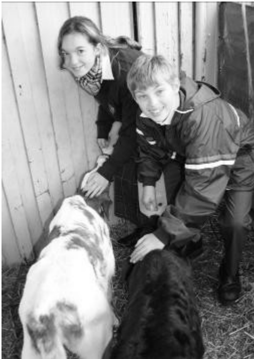
FEEDING THE CALVES