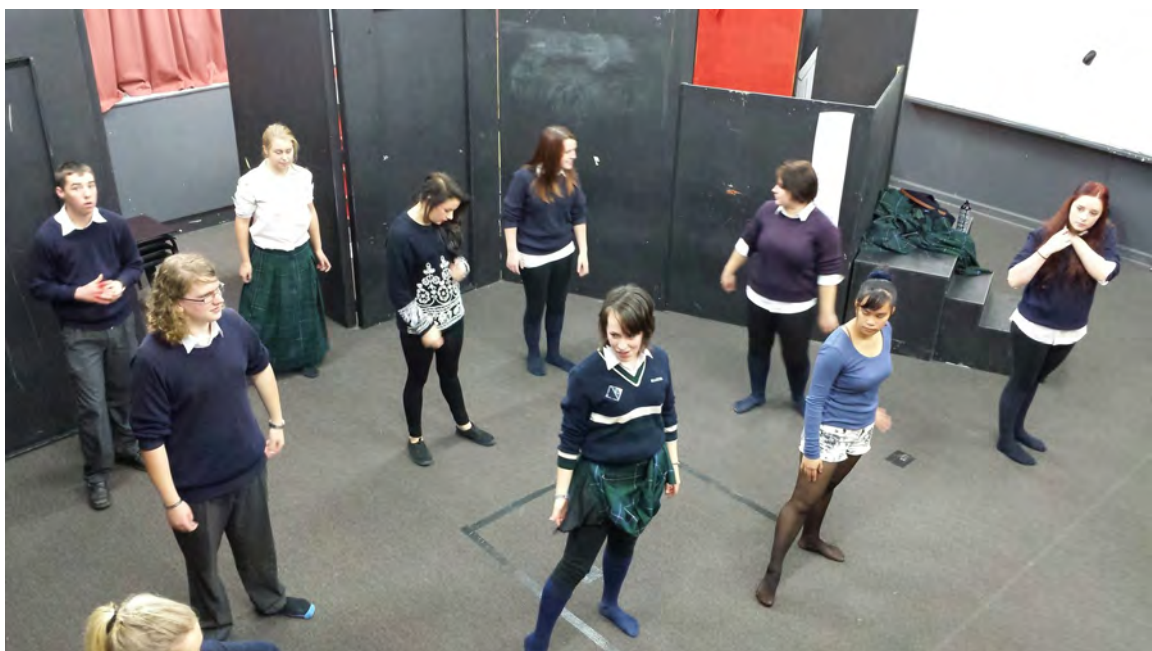
Cast members are working overtime to bring you the hit musical CHICAGO in 2013

CHICAGO is coming to you NEXT WEEK!!! The kids have put in so many hours, the staff are working tirelessly to bring you a performance you will never forget, so get your friends and family together and support a great night out in Hamilton August 28—31 at the PAC.