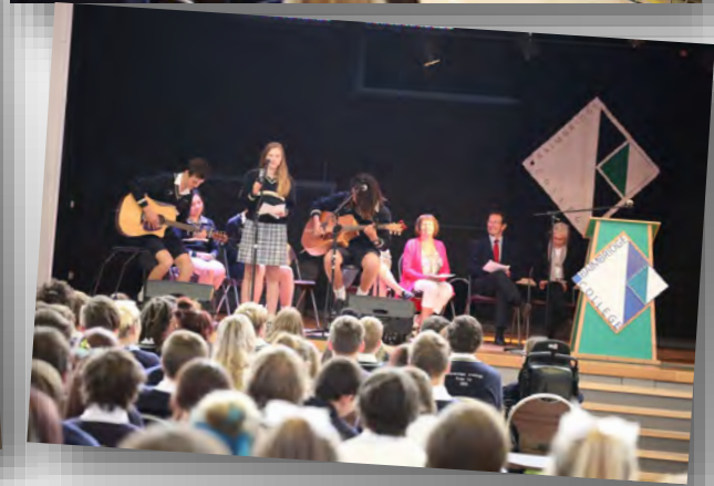
Some images of today's final Assembly for our Year 12 cohort.