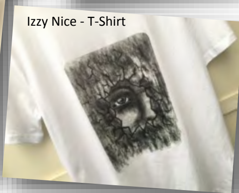
Izzy Nice - T-Shirt