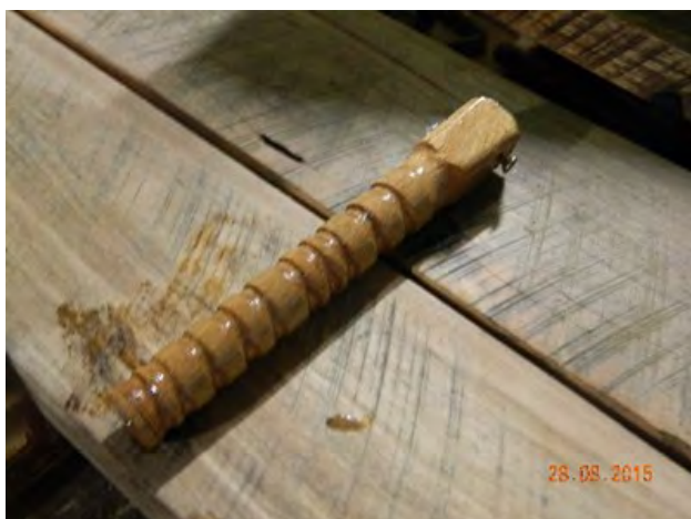
Grub bottle openers ($3)