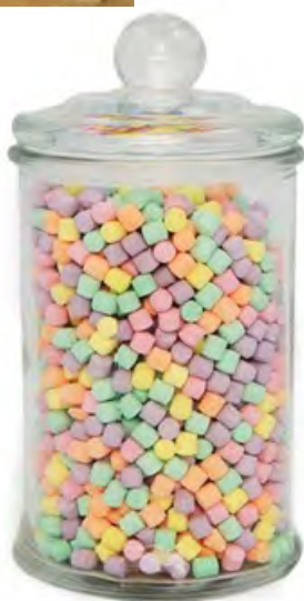
Lolly Jars (Varying in price from $4 to $5)