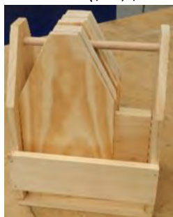
Drink Totes ($12, $15 with a bottle opener)