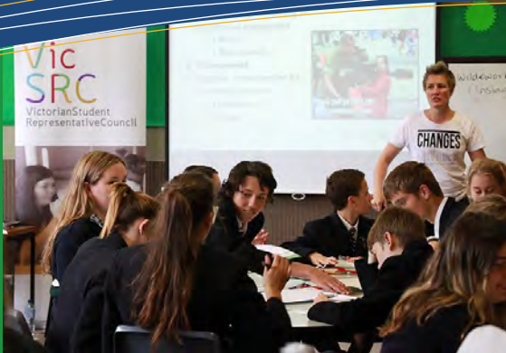
Baimbridge SRC members at the VicSRC Conference today in the VCE Centre.