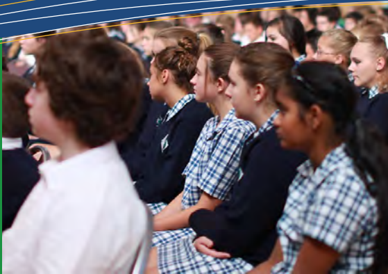
Year 7 students at their first General Assembly on Friday