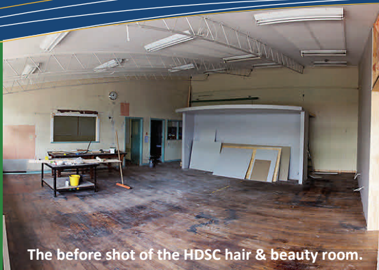
The before shot of the HDSC hair & beauty room.